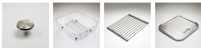
SP28B Basket waste plug