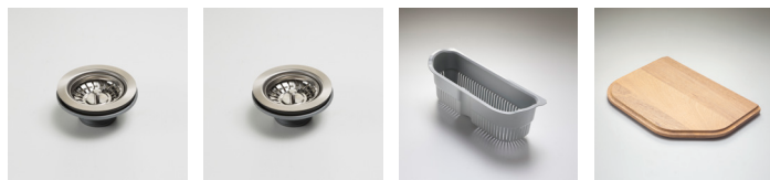
AC09 Basket waste