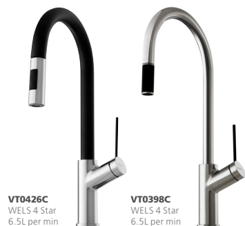
VT0426C WELS 4 Star 6.5L per min