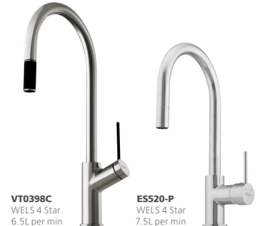
VT0398C WELS 4 Star 6.5L per min