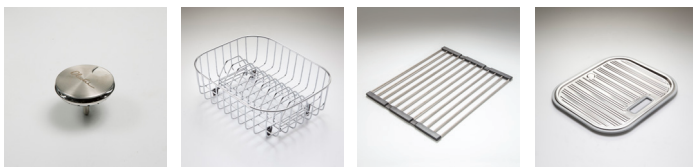
SP28B Basket waste plug