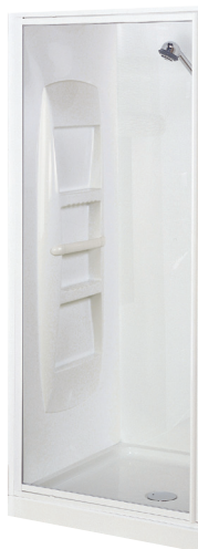
Note: Tapware and accessories illustrated in photography are not included

Available in a range of sizes and wall options, the Sapphire Alcove Shower is extremely versatile. Features a fully reversible door with 4mm toughened safety glass, and full length magnetic door seals. The Quick-Fit® tray features the ultra high 40mm upstand to enhance water tightness for long lasting performance.